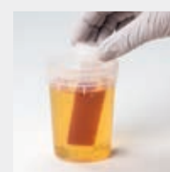
Dip or pour